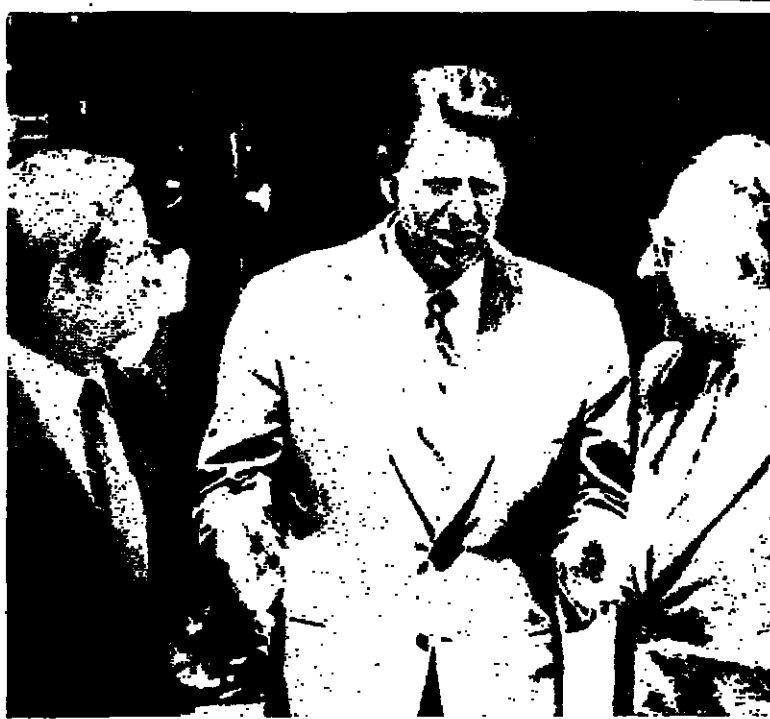
President Ronald Reagan photographed at the White House on Friday with Philip Habib, right, and the man he named to replace Habib as special envoy to the Middle East, Robert "Bud" McFarlane.

Two years later he became military assistant to Henry Kissinger and, two years after that, an official in the National Security Council.